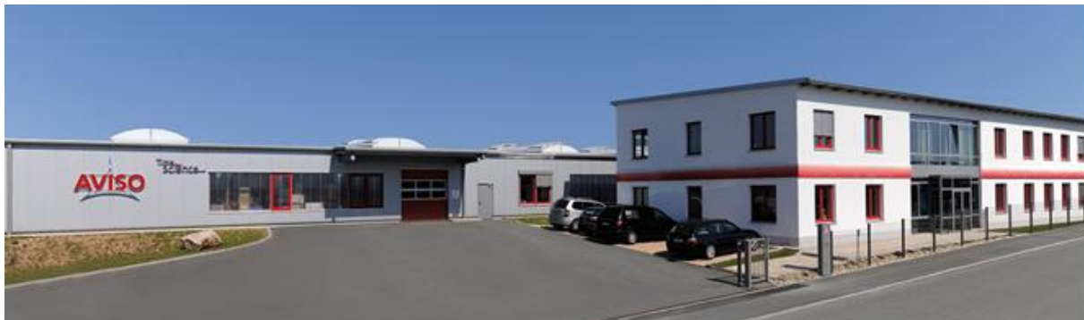
ALS headquarters in Jena, Germany

ALS Automated Lab Solutions GmbH is a producer of innovative systems which aid the development of new methods in stem cell and cancer research as well as antibody production. The required sophistication of our technological inventions can only be met by adhering to the highest levels of precision and quality. Therefore an international exchange of experiences involving renowned researchers in biosciences is one of ALS' priorities. Work on stem cells, insights in basic processes of cell reprogramming, and an understanding of how tissue and entire organs develop, will mark a turning point in medicine in the near future. To be able to meet these demands, regenerative medicine requires standardized procedures, so therapies will be both safe and efficient. For our customers from the analytics, pharmacy, biotechnology and medical engineering field, ALS is not only an experienced partner in scientific research, but also the expert for the development and manufacturing of technical device systems and component groups. Absolute transparency and the best possible service in dealing with these sensitive systems form the basis for a worldwide successful OEM-cooperation.