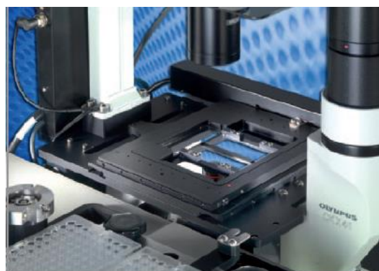
Crosstable – ALS GmbH, Jena, Germany

ALS develops customized solutions for your particular applications and purposes.