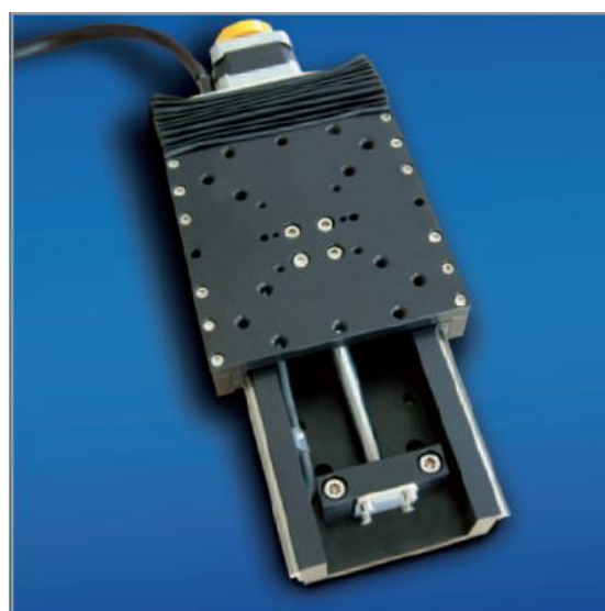
Motor-driven Precision Positioning Axis – Rollon GmbH, Ratingen, Germany