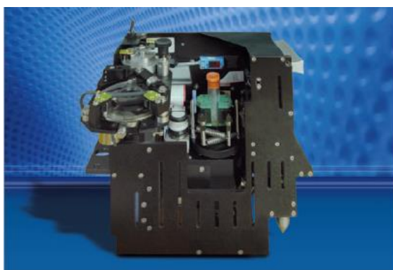
Decapper System – ATS Automation Tooling Inc., Cambridge, Canada