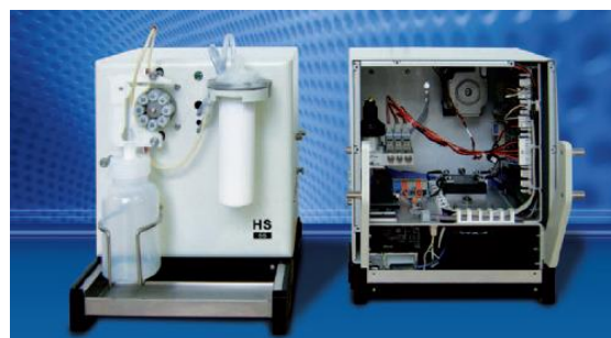
HS 55 – Analytik Jena AG, Jena, Germany