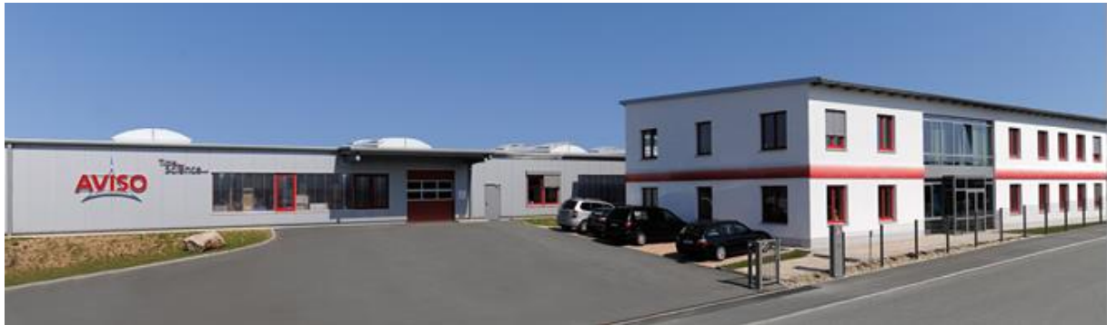
ALS headquarters in Jena, Germany

ALS Automated Lab Solutions GmbH is located in Jena, a dynamic city famous for microscopy and material science. ALS is a specialist for the development of innovative technological solutions for cell biology research and molecular biology. ALS lifts cell culture to a new level of choice and control on the leading edge in cell biology, cell therapy research, regenerative medicine and drug discovery. With automation and standardization of laborious manual procedures, ALS supports science and research for more efficiency and the creation of new methods for the science of tomorrow.